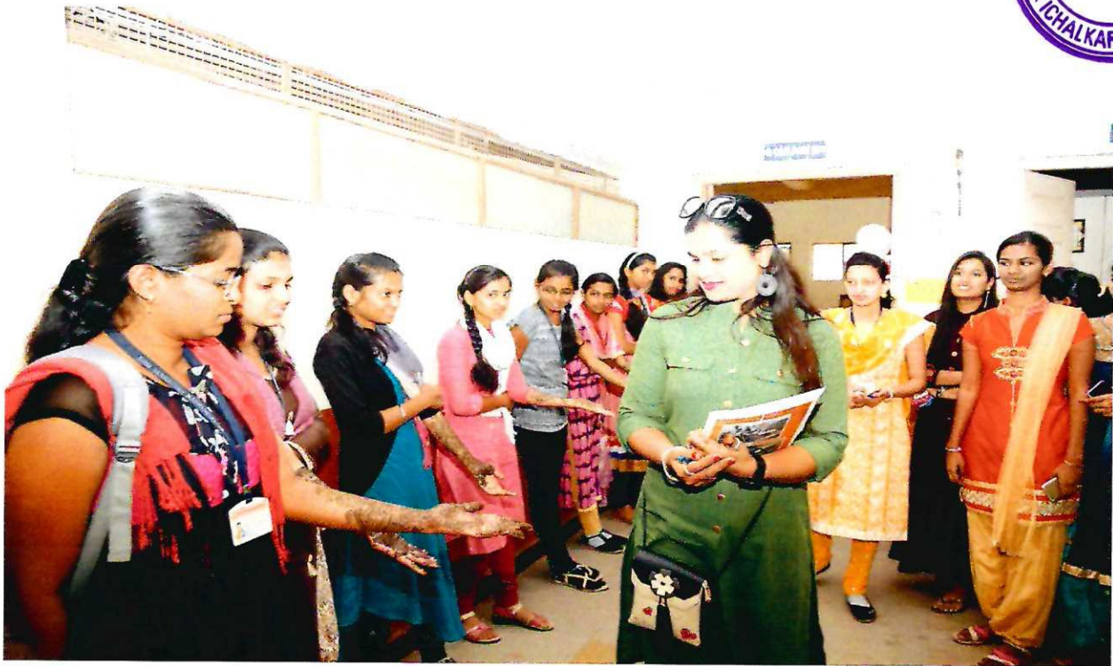
Examination of Mehendi Competition