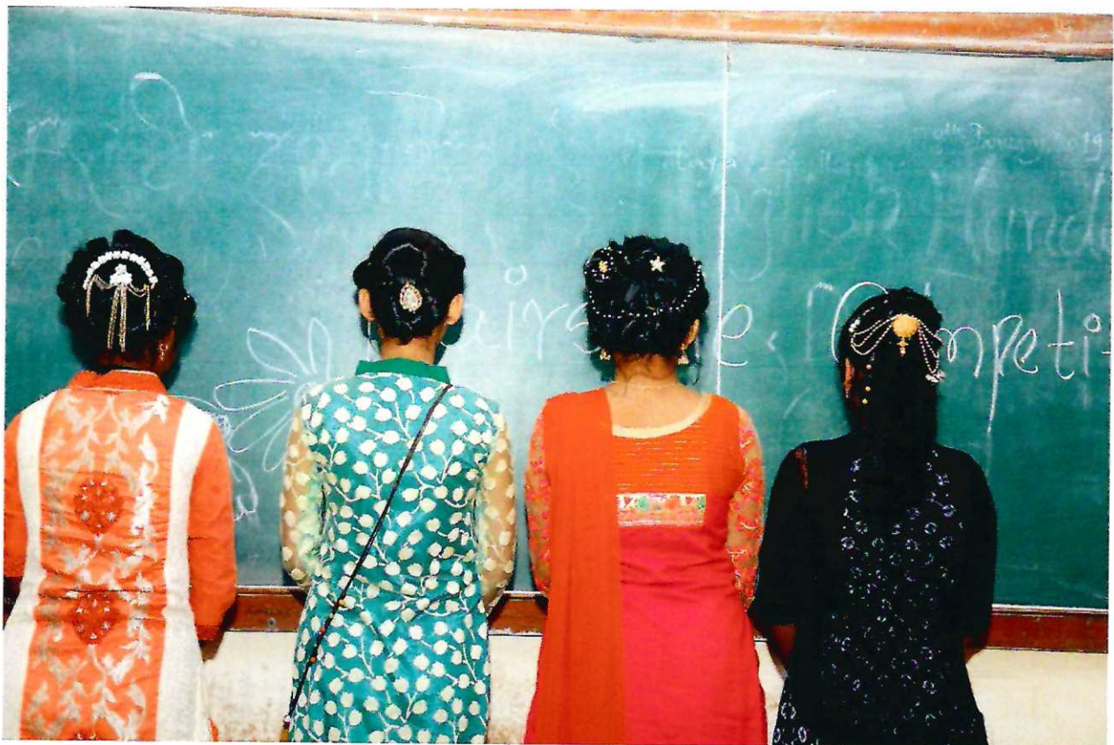
Hair Style Competition