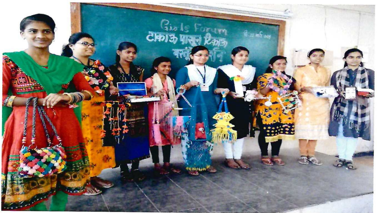
Best of West