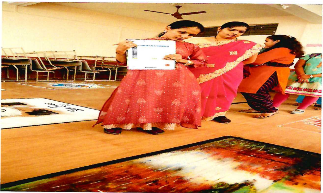
Examination of Rangoli Competition