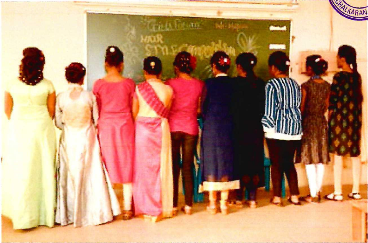
Hair Style Competition