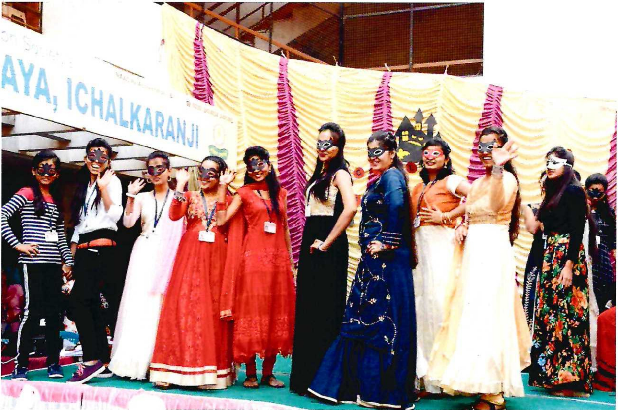
Horror Theme Competition