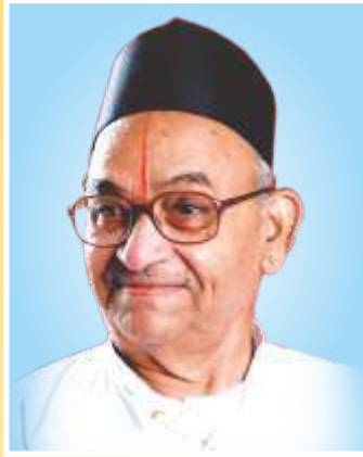
Hon'ble Shri. Madanlalji Bohara