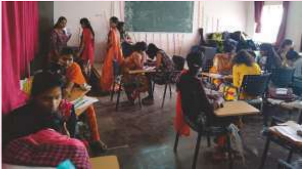
युवा महोत्सवातील मेंहदी स्पर्धेतील सहभागी स्पर्धक