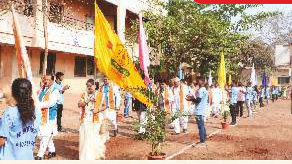
पदवीदान समारंभ रॅली