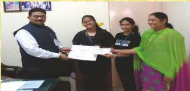
आविष्कार विभागा अंतर्गत 'अविष्कार महोत्सव' आणि संशोधन स्पर्धेतील सहभागी विद्यार्थीनींचे अभिनंदन