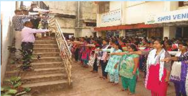
दि. 26 नोव्हेंबर 2019 'संविधान दिन' साजरा करण्यात आला.