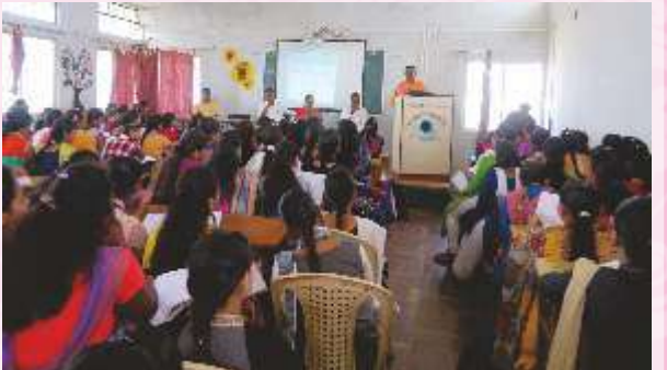
मेडीकल क्लब, गर्ल्स फोरम, माजी विद्यार्थी संघटना व आधार ब्लड बँक यांच्या संयुक्तविद्यमाने विद्यार्थीनींना आरोग्य विषयक सल्ला व मार्गदर्शनपर व्याख्यान आणि विद्यार्थीनींची हिमोग्लोबिन तपासणी