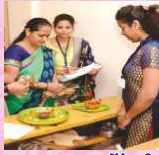
पाककला स्पर्धेचे परीक्षण करताना परीक्षक व प्राचार्य