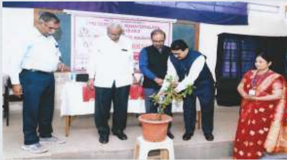
Accountancy Department Organised One Day Workshop on " Revised Syllabus of B.com II (Sem III & IV) For the Subject of Corporate Accounting Paper No I & II Dated on 28 th Aug 2019,