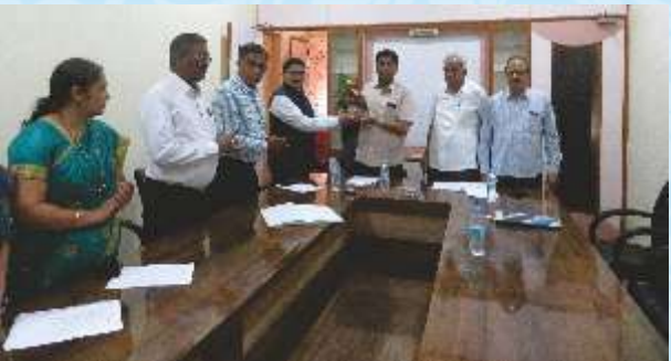
IQAC विभागाची मिटींग