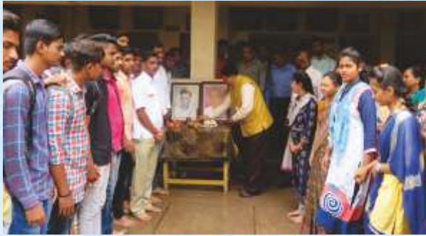
दि. 1 ऑगस्ट 2019 लोकमान्य टिळक पुण्यतिथी व लोकशाहीर आण्णाभाऊ साठे जयंती