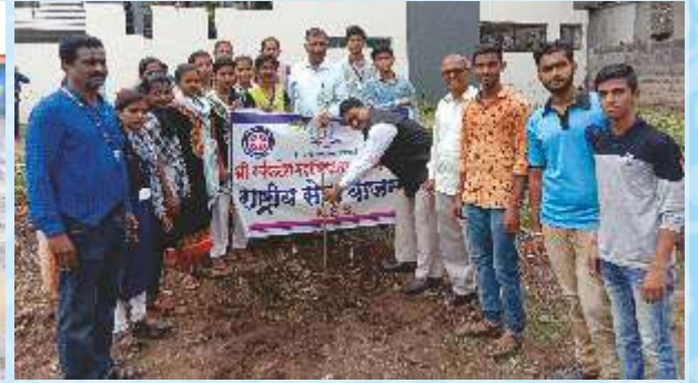
राष्ट्रीय सेवा योजना अंतर्गत वृक्षारोपण