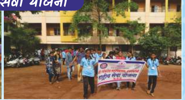
राष्ट्रीय सेवा योजना अंतर्गत इचलकरंजी शहरात प्रबोधनात्मक रॅली