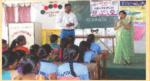
राष्ट्रीय सेवा योजना व वाड:मय मंडळ यांच्या संयुक्त विद्यमानाने पर्यावरण संवर्धन विषयक FFF ACTIVITY चे आयोजन