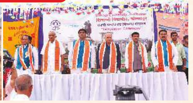
पदवीदान समारंभातील सुरुवात राष्ट्रगीताने