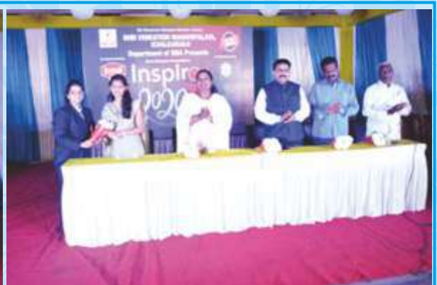
Insprio Prize Distribution