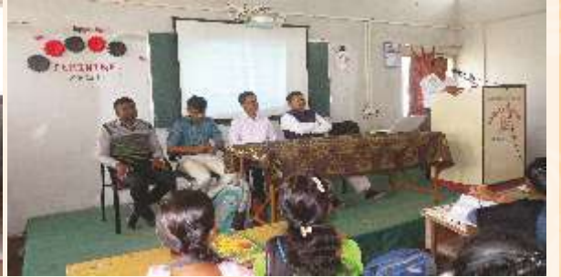
Placement Assistance cell मार्फत E-Banking and E-Payment या शॉर्ट टर्म कोर्सच्या विद्यार्थ्यांसाठी दोन दिवशीय कार्यशाळेचे आयोजन