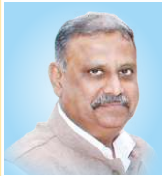
Hon'ble Shri. Uday Lokhande