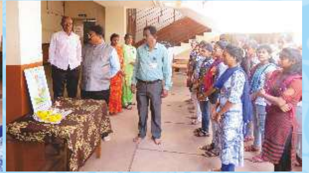
दि. 29 ऑगस्ट 2019 रोजी स्पोर्ट्स विभागा मार्फत क्रीडा दिन साजरा करण्यात आला.