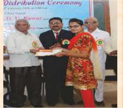
महाविद्यालयातील यशस्वी विद्यार्थ्यांना मान्यवरांच्या हस्ते प्रशस्तिपत्रक व पारितोषिकांचे वितरण करताना