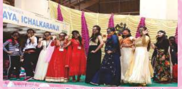
स्पर्धेतील हॉरर थिम अंतर्गत वेशभुषा स्पर्धेतील स्पर्धक