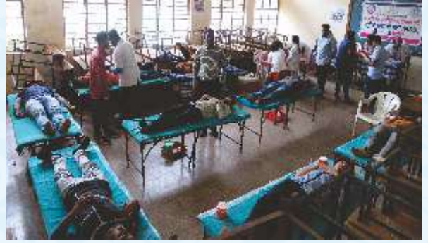
राष्ट्रीय सेवा योजना अंतर्गत रक्तदान शिबीराचे आयोजन