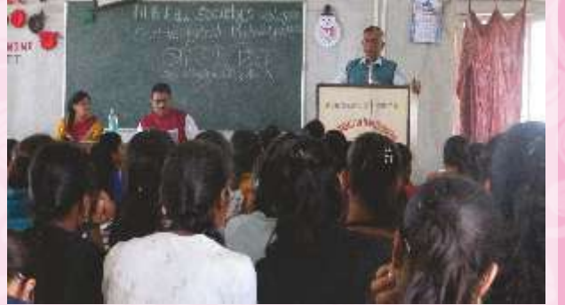
दि. 24/1/2020 रोजी बालिका दिनानिमित्त महाविद्यालयातील विद्यार्थीनींचे काव्य वाचन, नाटिका सादरीकरण