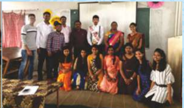
Fresher's 2k19 Moments