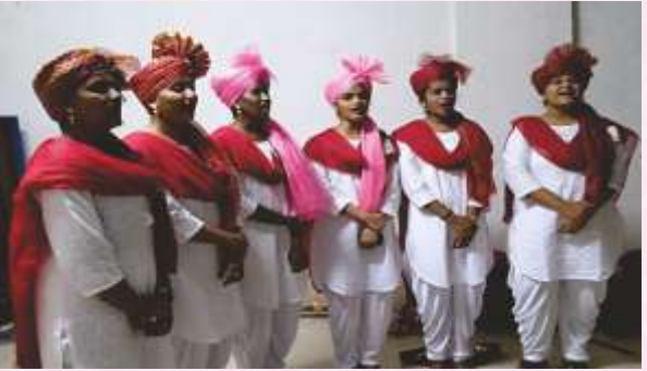
युवा महोत्सवातील सुगम गायन स्पर्धेतील सहभागी स्पर्धक