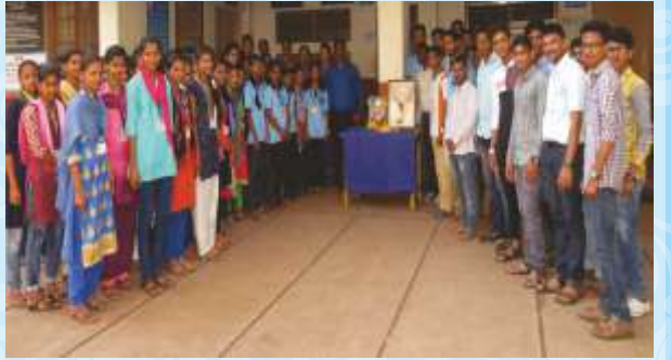
दि. 2 ऑक्टोबर म.गाधी जयंती व लालबहादूर शास्त्री जयंती