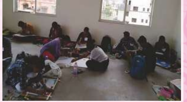
युवा महोत्सवात चित्रकला स्पर्धेतील सहभागी विद्यार्थी