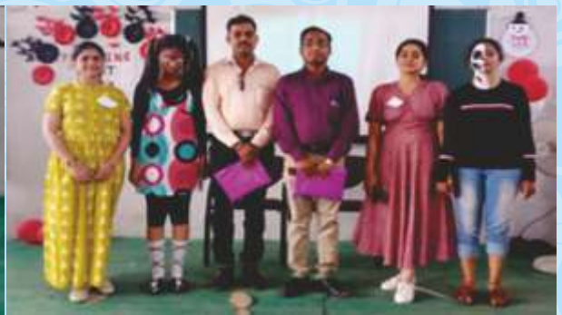
Moment of face painting Activity