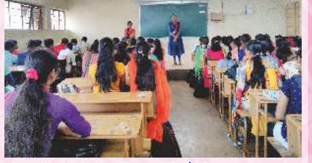
दि.14 सप्टेंबर रोजी लिटररी असोसिएशन अंतर्गत हिंदी दिन साजरा करण्यात आला