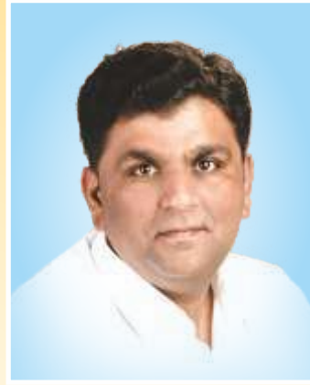
Hon'ble Shri. Harishji Bohara