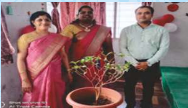
Inauguration of Feminine Zest-2k19