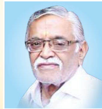
Hon'ble Shri. Rajgopal Dalya