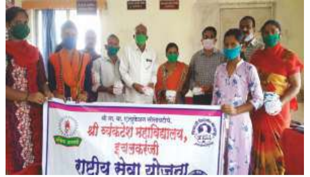
एन.एस.एस. विभागामार्फत लॉक डाऊन कालावधीत मौजे. टाकवडे येथे एन.एस.एस विभागाच्या वतीने टाकवडेतील ग्रामस्थांना 500 मास्कचे वाटप करण्यात आले.