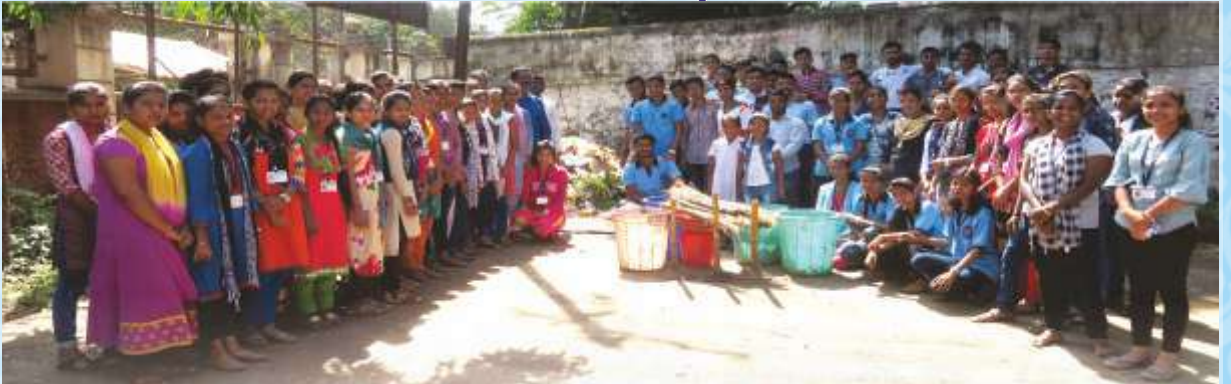
राष्ट्रीय सेवा योजना अंतर्गत महाविद्यालयीन आवारातील स्वच्छता